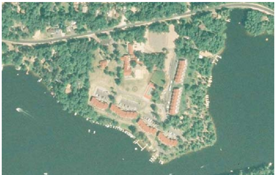
Nearshore development can replace a lake's natural filters—wood, wetlands, and shoreland plants—with hard surfaces such as roads and lawns that can increase runoff and nutrient loads.

A lot of potential property buyers are attracted to lakes because of their natural assets, and decisions about buying waterfront property may be influenced by factors such as water clarity and lakeviews. The trees and shorelands enjoyed by many lake people also protect the lake by helping