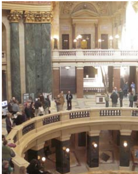
The Wisconsin State Legislature makes important state budget and legislative decisions that can affect the management of our natural resources. Whether you meet with, call, write, or e-mail, establishing a relationship with your representatives is an essential part to ensure policy decisions reflect constituent values.

Signing on to a form postcard or a form email won't matter to my legislators. Legislators certainly recognize that you lead a busy life. Most legislators understand that a "form" letter doesn't make the opinion of the sender any less valuable. It only